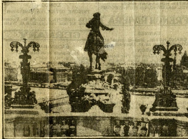
This view of Budapest, taken from the gardens of the Royal Palace, shows an impressive sweep of the city. The Statue in the foreground is that of Prince Eugene of Savoy.

studied needlework yet produce technically perfect embroidery and laces.