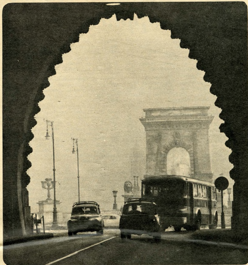
The Chain Bridge seen from the Buda side through the tunnel—also Adam Clark's work

When in 1849 the building workers—who were also British—finished mounting the last chain, amid the cheering of the crowd watching the operation, the daring Count balanced his way across from Buda to Pest. He was 57 years old at the time.