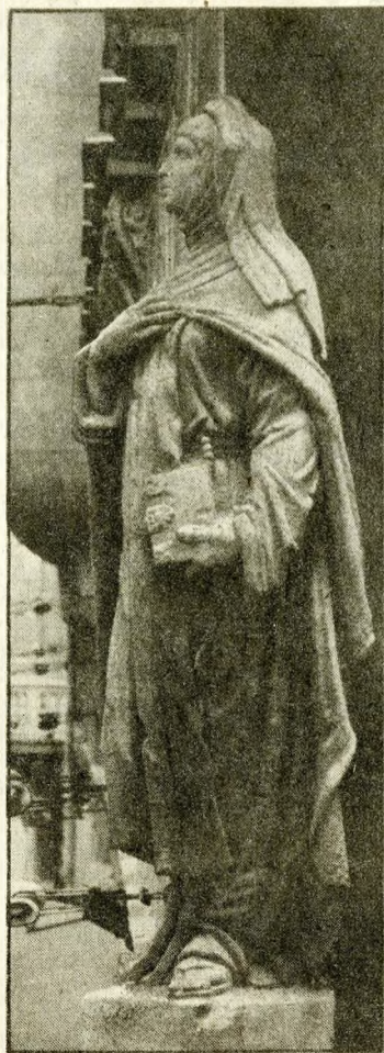
The statue of Saint Theresa of Lisieux on the house standing on the corner of Csányi utca and Majakovszkij utca

A few hundred metres in the opposite direction brings us to the longest passage in Budapest, the Gozdsu udvar, which connects Majakovszkij utca, and the parallel Dob utca and is the traditional centre of silversmiths' workshops. In a few minutes