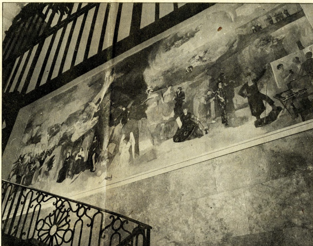
Aurél Bernáth's fresco "History" in one of the staircases of the Hungarian Academy of Sciences building in Országház utca

However, beside Matthias Church or the Budapest History Museum there are several interesting places in the Castle