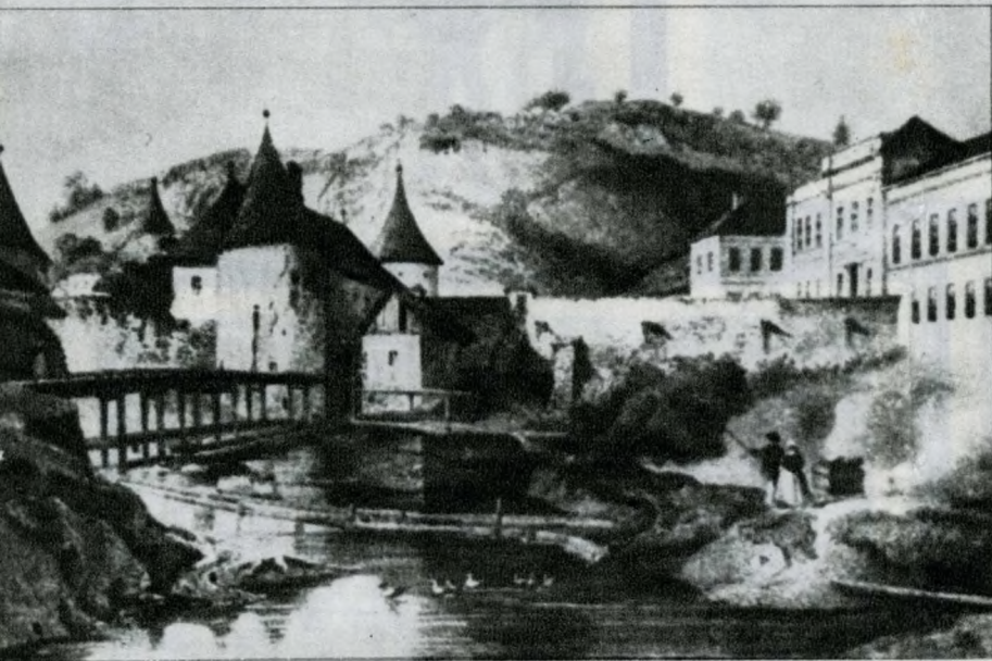
The Császár Bath and the old mill (contemporary drawing).

This bath also had an uncanny attraction for would-be suicides, it appears. But the bath's attendants were on the alert: at the sound of a revolver shot, they would descend on the spot with buckets of sand and with brooms to remove traces of the tragedy.