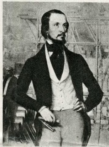
A portrait of Adam Clark.

The engineer was a self-assured, cool and reserved individual. Széchenyi, on the other hand, was all nerves and temperament. The preparatory talks were stormy and the two personalities often clashed with each other. Clark prepared a project for the construction of the