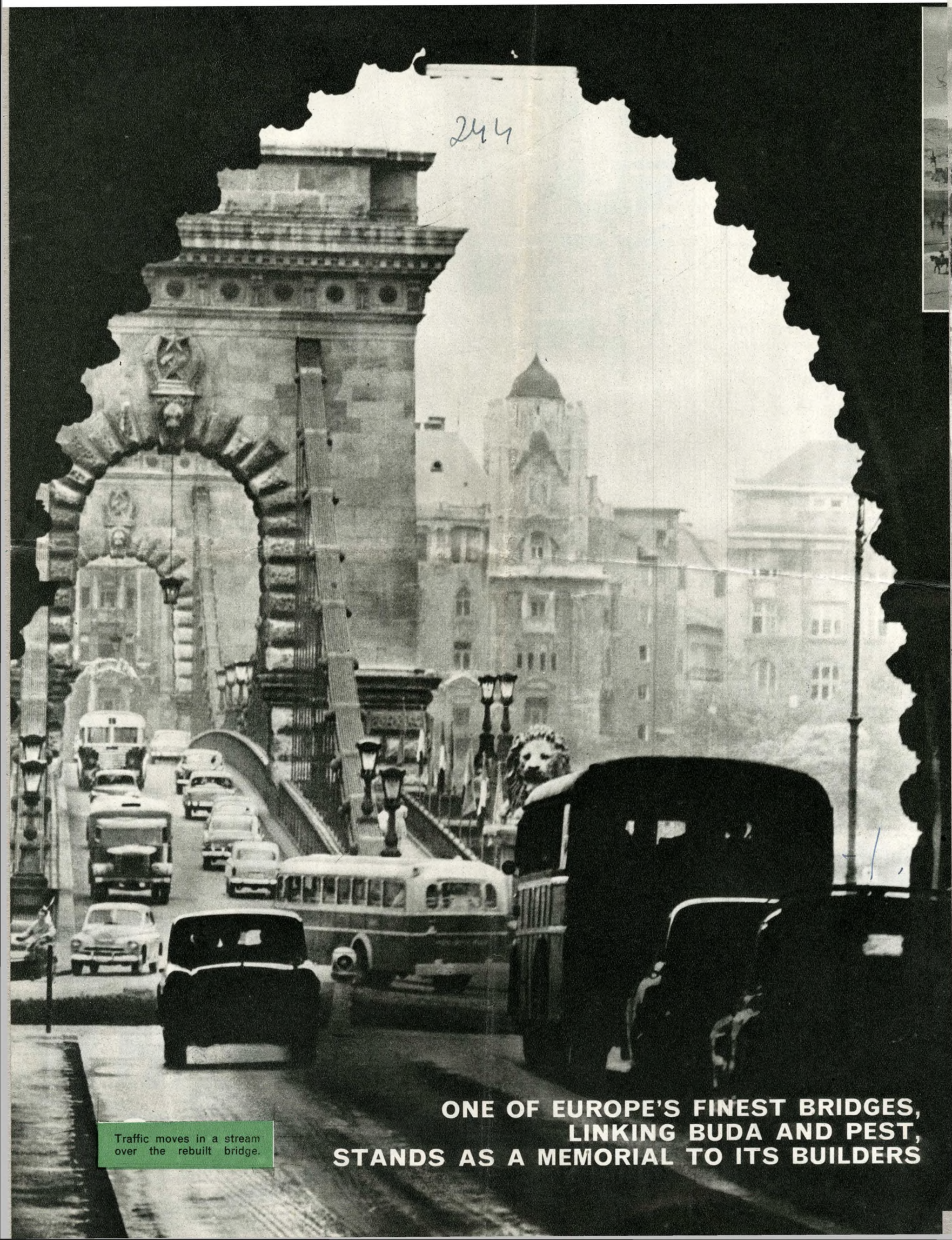
Traffic moves in a stream over the rebuilt bridge.

ONE OF EUROPE'S FINEST BRIDGES, LINKING BUDA AND PEST, STANDS AS A MEMORIAL TO ITS BUILDERS