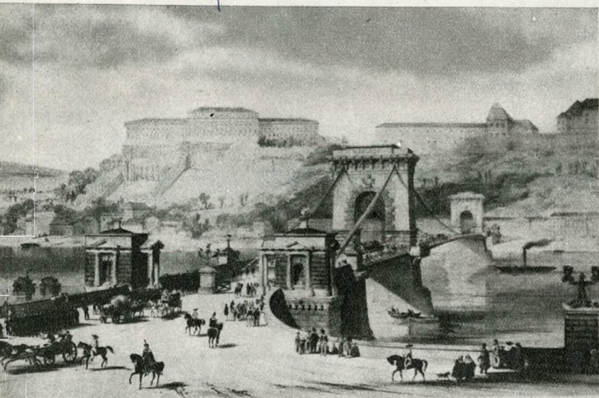
The bridge in the 1850s.

bridge and appended an elevation and some sections; but first there was a long argument over whether the bridge was to be of wood, stone or iron, and if the last, then whether it should be suspended on chains or not. Many considerations, partly economic, partly aesthetic and partly of durability, argued for a suspension bridge. This was Széchenyi's final choice, and he returned with Clark's plans.